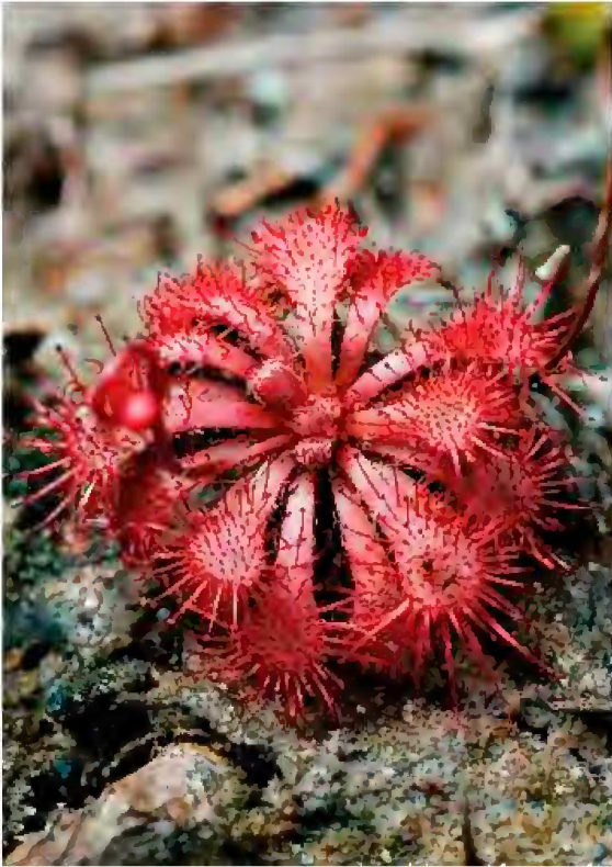
Figure 3: Close-up of a rosette of D. spatulata var. bakoensis . Note the distinctly petiolate leaves.